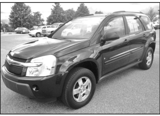
2006 Chevy Equinox LS AWD