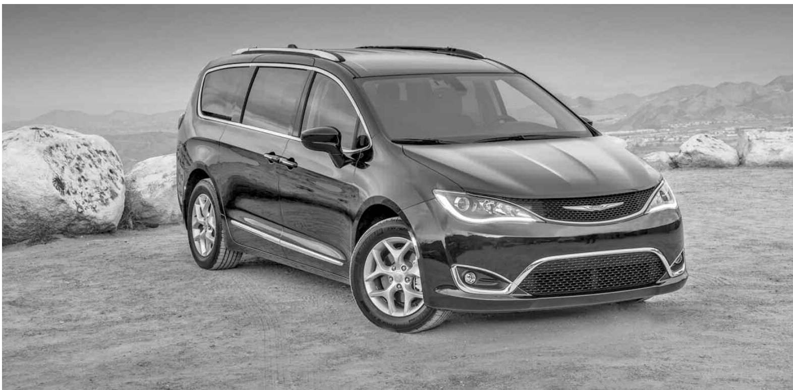
With an unsurpassed level of attention to detail and quality, the all-new 2017 Chrysler Pacifica is poised to deliver segment-leading durability and reliability.

With an unsurpassed level of attention to detail and quality, the all-new 2017 Chrysler Pacifica is poised to deliver segment-leading durability and reliability. Thousands of simulated and laboratory tests conducted on Pacifica set the foundation for the regimented reliability, capability and durability testing that continues at FCA US LLC's proving grounds around the world.